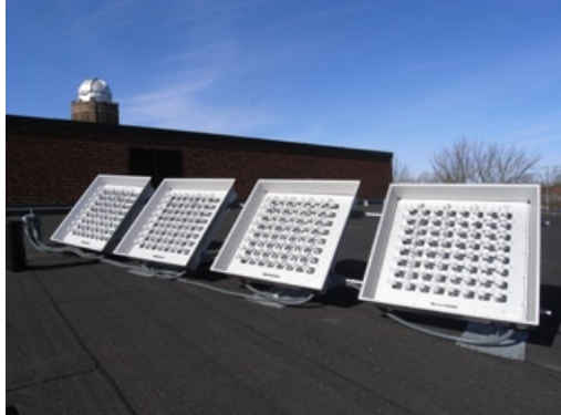
Lund University, Sweden. Parans' solar lighting delivers sunlight in meeting room.

Parans' solar lighting is a popular choice for use in offices, hospitals, retail areas and many public places. The installation is as simple to fit in existing buildings as it is to install in new construction, transforming a dark room with natural sunlight.